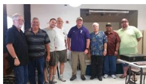
TAMDC President and the San Antonio Area Metal Detecting Club Officers-July 13, 2017

Me and the TAMDC Officers took a much-needed break through the month of June and July, but now we're back on schedule and planning the Fall and Spring Satellite Hunts and the Treasure Show coming April 20-22, 2018. Speaking of the Treasure Show, mark your calendars because we have some new things happening like new times, new events, a night hunt and more. Our flyer can be download at www.tamdc.org and is shown below. We do ask that your club begin to make plans now on attending and help us promote this event by placing the flyer on your club's website. We do have colored versions of the flyer available to-please email preacherdigger49@gmail.com if you prefer color.