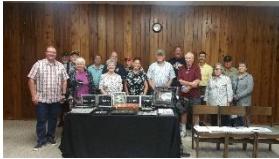
TAMDC President and the Highland Lakes MD Club Sept. 7, 2017

On September 7 th , I made a trip to visit a new prospective club in the Burnet, TX area called Highland Lakes Metal Detecting Club. I spoke about the purpose and benefit of being part of the TAMDC. There were 21 people in attendance and afterwards they joined the TAMDC. On September 21 st , I am scheduled to speak at the Montgomery County Artifacts and Recovery Club in Conroe, TX.