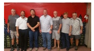
TAMDC President and the Treasure Hunters Association of Pasadena Club Officers-Aug. 7, 2017

I've been very busy out visiting different clubs and speaking and promoting the benefits of becoming and being a member of the TAMDC. In July, I visited the San Antonio Area MD Club, in August I visited a new prospective club, the Pasadena Treasure Hunters Association, in which I believe they are planning on joining the Association.